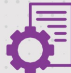
Study of Processes